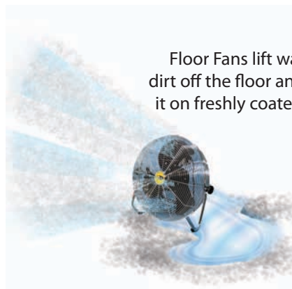
Floor Fans lift water and dirt off the floor and deposits it on freshly coated screens.

6. Drying Coated Screens: A hot box is ideal to dry screens quickly and completely without affecting humidity levels in the screen room. If you don't have a hot box try coating at the end of the last shift and allow the screens to dry overnight. Leave the de-humidifier on to keep humidity levels down. Avoid drying screens with a floor fan. It will pick up dust and deposit it on your freshly coated screens, instead use a fan with a stand to keep it 3 feet or more above the floor.