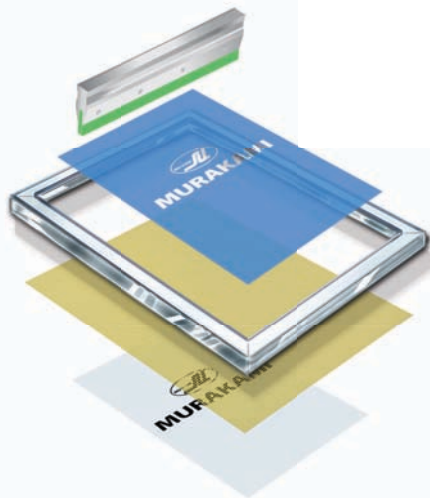
The Perfect Screen

We go out on technical sales calls to solve exposure issues as part of our effort to sell and provide support for our emulsions. What do we encounter? The screen room was designed as an after thought to the overall layout of the production area. A good exposure unit goes a long way in achieving the 'perfect screen' but a poorly laid out screen room area can negate all the qualities of a good lamp. The ultimate goal is non-stop press production, few pinholes, no break-downs on press, all of which generate better profits. A well planned screen room prevents poor exposure, standardizes the environment of the room, and leads to predictable stencil performance.